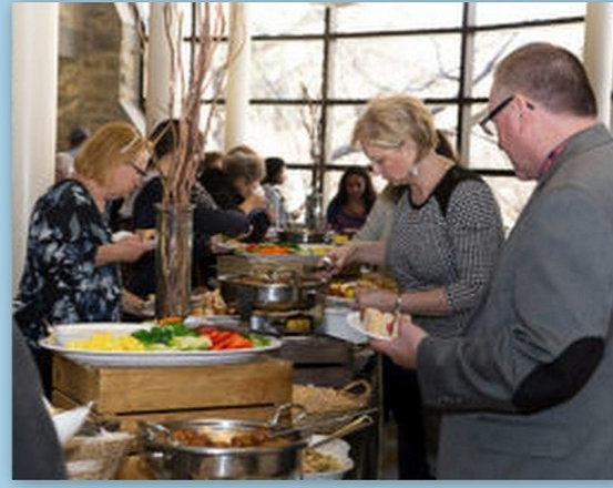
Participants enjoy a delicious reception at the Mission Center after the Feast Day Mass and presentation of the Justice Award.

"God is to lead my soul on the road He wills and I wish to follow Him and obey His call." M.M. Katharine