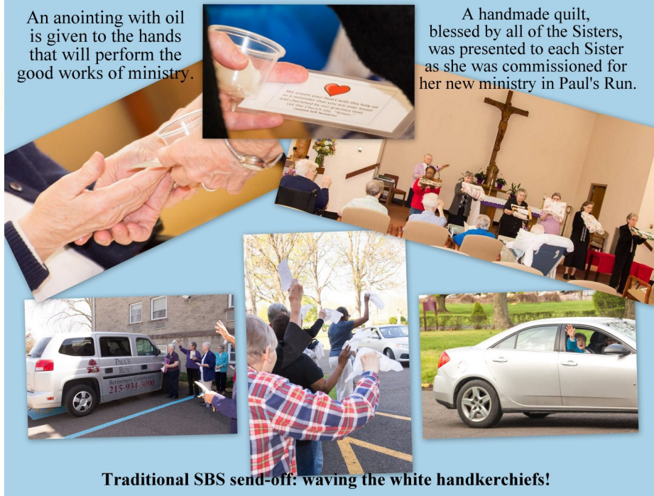
Traditional SBS send-off: waving the white handkerchiefs!

A handmade quilt, blessed by all of the Sisters, was presented to each Sister as she was commissioned for her new ministry in Paul's Run.