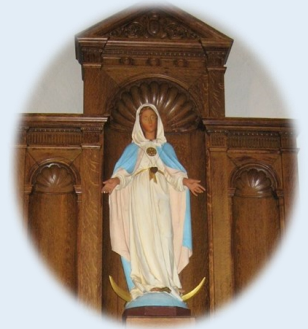
BVM statue in St. Elizabeth Chapel at the National Shrine of St. Katharine Drexel

Mary, our Blessed Mother, is mother to us all. We have her love, guidance, help and protection for all time. While on earth, Mary gave herself completely to do God's will and was a blessed example of a mother's life of caring for those she loved. Mary intercedes for us with her Son as our own earthly mothers often do for their children.